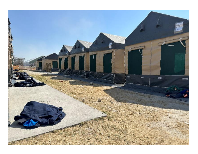
Matted Sheltering built in front of our Cabins for your patrons

Usually after building a village we give the following options a small fee. (Described in Pictures)