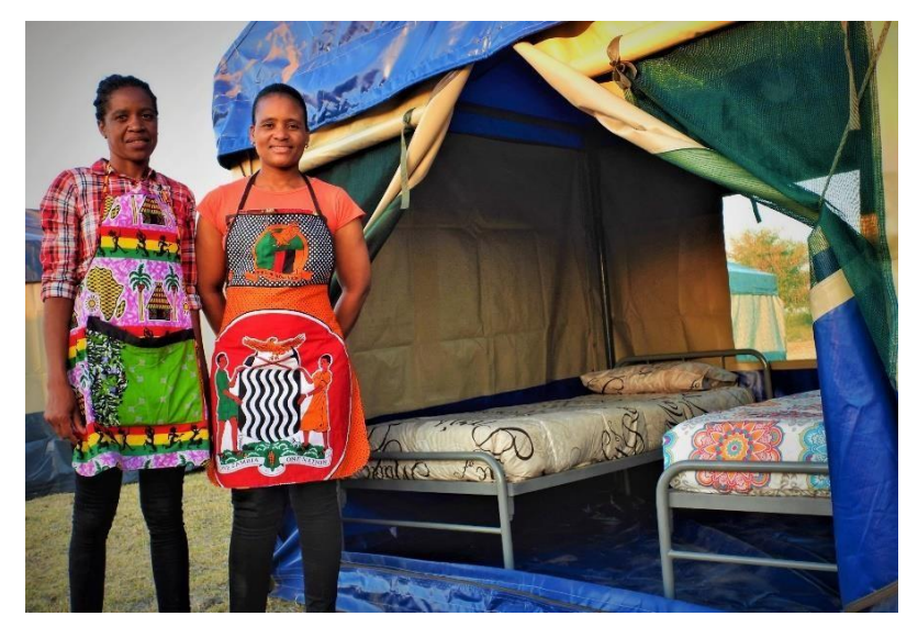
OPT: Housekeeping with Long Stay villages