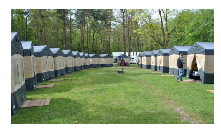
03/18... Private Tunction - Deneysville, Free Sate