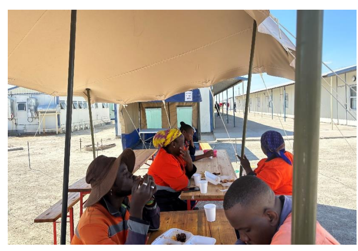
Communal Center offering some selected meals, Cellphone Bus Charging facilities ETC