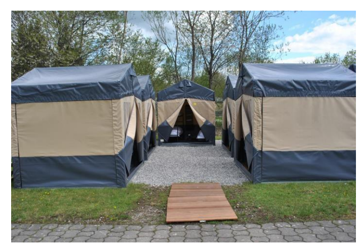
03/19... CONCO Grp Staff Camp