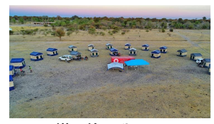
10/29... Maun Ngami Botsulana