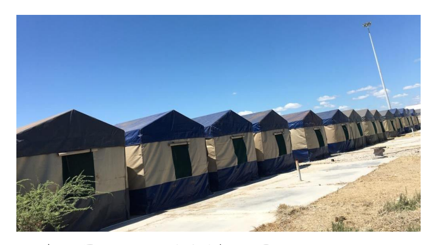
03/22.. Botswana Ash Main Camp