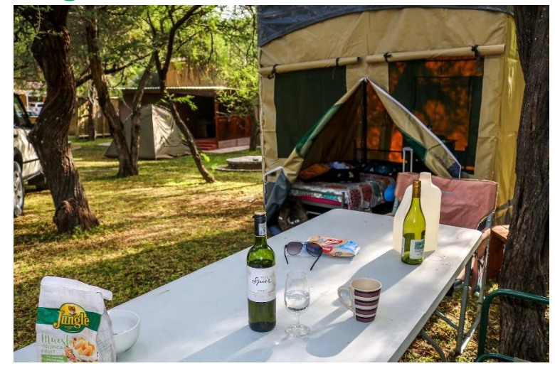
OPT: Chairs & Tables with cabins

Our main objective is to always relief our customers. That's why we have a turn-key delivery .