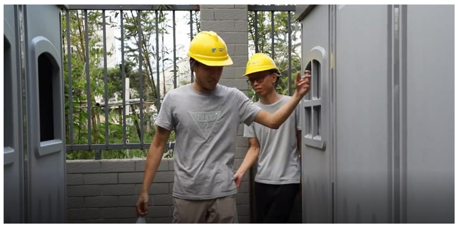
Construction Workers Housing